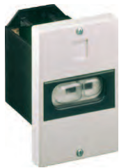
Flush Mounting Enclosure IP55 with integrated pe(N) terminal