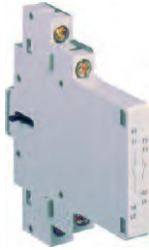
Auxiliary contact blocks for side mounting (3.5A/230VAC; 2A/400V AC)