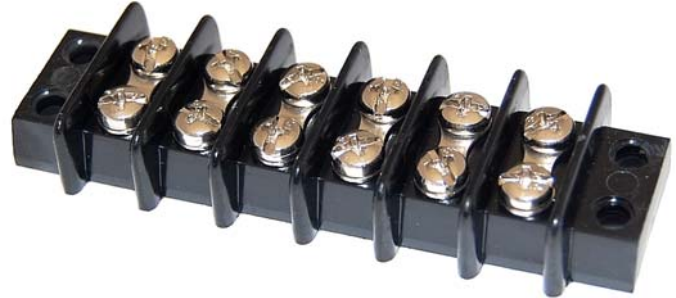
(6 Pole shown)

Terminal Block– Open Back 20 Amps, 300 Volts (AC/DC)