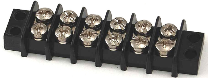
(6 Pole shown)

Insulator Strip Required for Voltage Rating