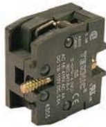
S5* Normally Open Silver