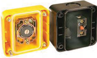
Plastic Enclosure with base mount contacts and metal operator