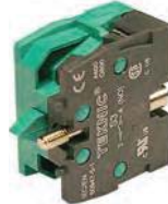
S3 Normally Open Gold plated