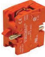
S2 Normally Closed Silver