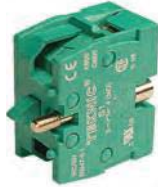
S1 Normally Open Silver