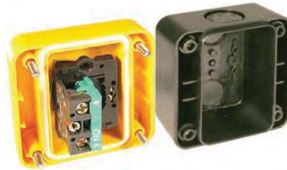
Plastic Enclosure with panel mount contacts and plastic operator