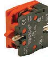
S4 Normally Closed Gold plated