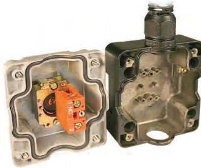
Cast Aluminum Enclosure with panel mount contacts and metal operator