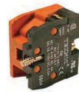
S8* Normally Closed Gold plated