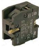
S6* Normally Closed Silver