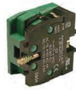
S7* Normally Open Gold plated