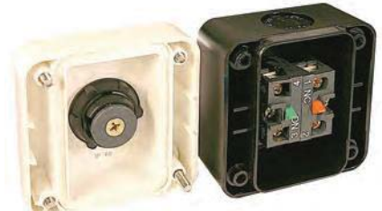
Plastic Enclosure with base mount contacts and plastic operator