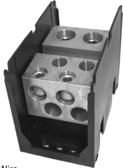
One pole shown