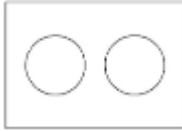
Line Side 2) 600 kcmil - 2 AWG

UL Class B, C (known as Rigid Stranded, Building Wire, Code Wire)